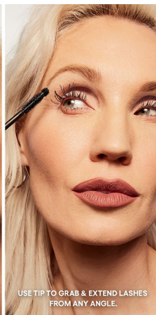
USE TIP TO GRAB & EXTEND LASHES FROM ANY ANGLE.