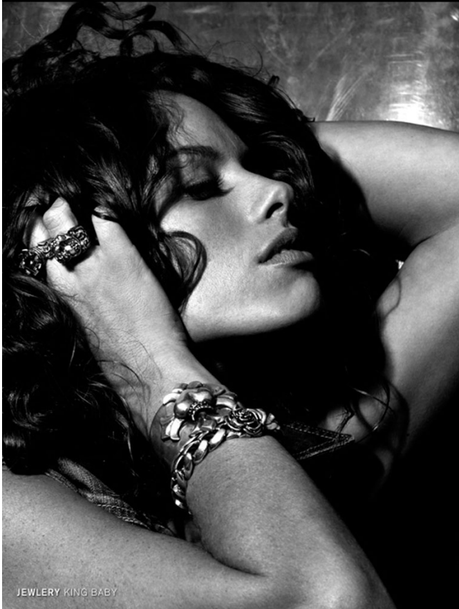
JEWELRY KING BABY