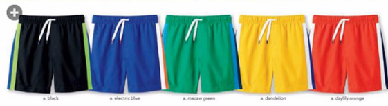
a. black a. electric blue a. ocean green a. dandelion a. daylily orange

Get this look: Painted Stripe Bath Guard, design as pictured (top), 478753-PS8, g. 4); Volley Printed Bath Ring, white multi-stripe, all styles imported, landsend.com