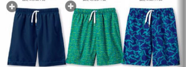
navy seas solid swim trunks, $19.50, 476820-P57