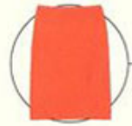
Skirt, The Limited , $59.90.