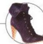
Booties, Steve Madden , $169.

↑ ANOTHER LOOK FOR THE PANT: ADD A SPARKLY TWEED AND A WEAVER-HIGH RED PLATFORM FOR EVENING.