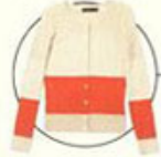
Cardigan, The Limited , $49.90.