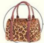
Bag, Bakers , $52.