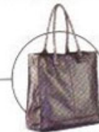
Bag, J.Jill , $139.