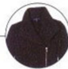
Jacket, Gap , $59.95.