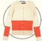
Cardigan, The Limited , $49.90.