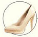
Pumps, Aldo , $75.