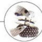
From the top: Wave bangles, Express , $16.90. Spike bangle, Forever 21 , $4.80. Bracelet, Banana Republic , $55.

A RELATED PANT SHOULDN'T BE TOO BAGGY. MAKE SURE IT STILL FLATTERS YOUR BODY SHAPE.