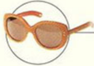
Sunglasses, Marc Jacobs , $325. Available at Solstice .