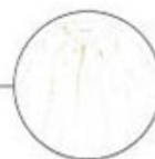
Peasant blouse, Lucky Brand , $99.