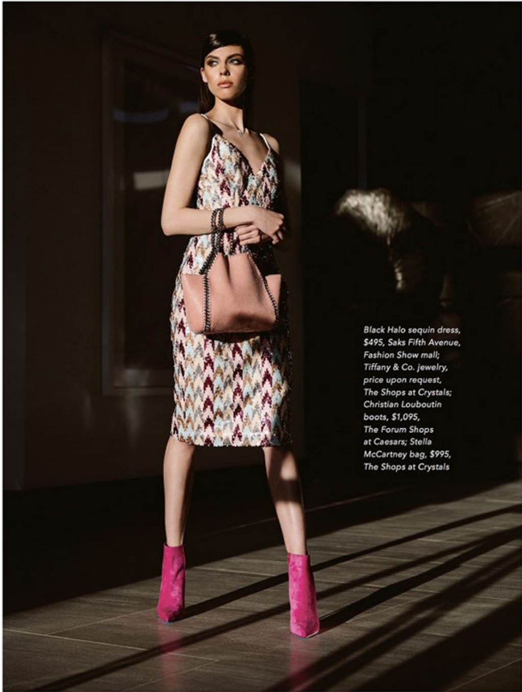
Black Halo sequin dress, $495, Saks Fifth Avenue, Fashion Show mall; Tiffany & Co. jewelry, price upon request, The Shops at Crystals; Christian Louboutin boots, $1,095, The Forum Shops at Caesars; Stella McCartney bag, $995, The Shops at Crystals