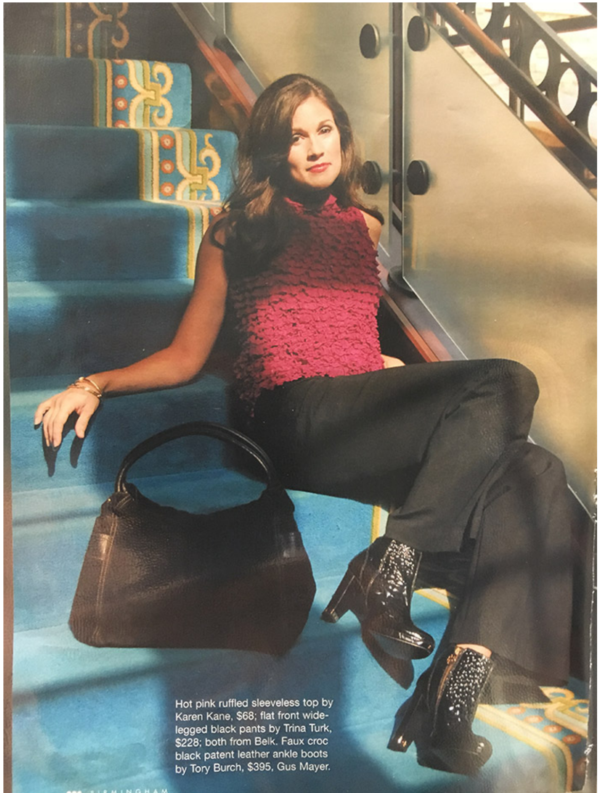
Hot pink ruffled sleeveless top by Karen Kane, $68; flat front wide-legged black pants by Trina Turk, $228; both from Belk. Faux croc black patent leather ankle boots by Tory Burch, $395, Gus Mayer.