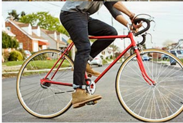
SKINNY JEAN | STYLE No. 3060