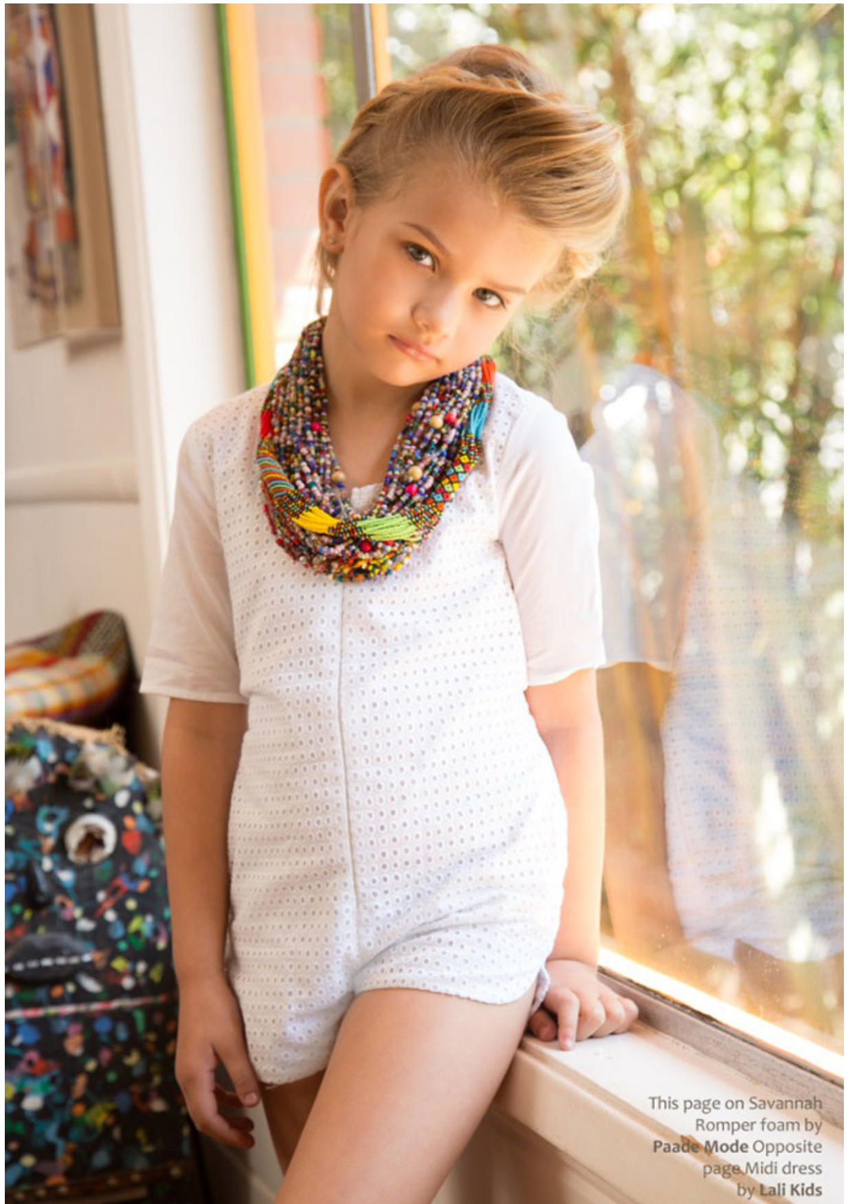
This page on Savannah Romper foam by Paade Mode Opposite page Midi dress by Lali Kids